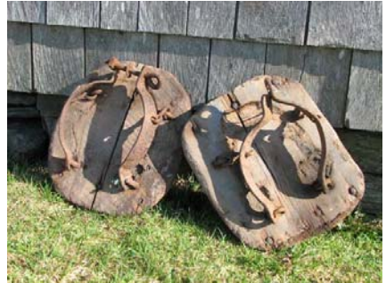
11) Mud shoes for oxen