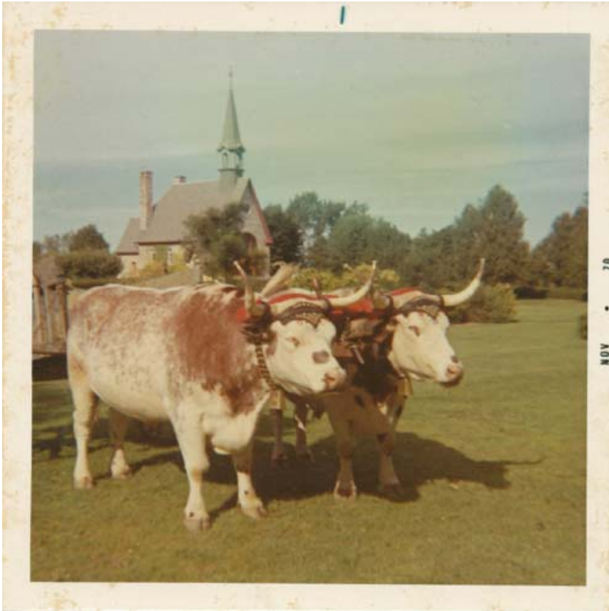
10) Oxen at Grand-Pré in 1976