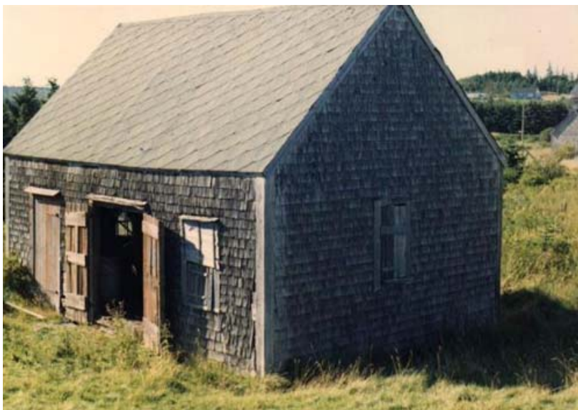
7) The blacksmith shop before it was demolished and moved to Grand-Pré